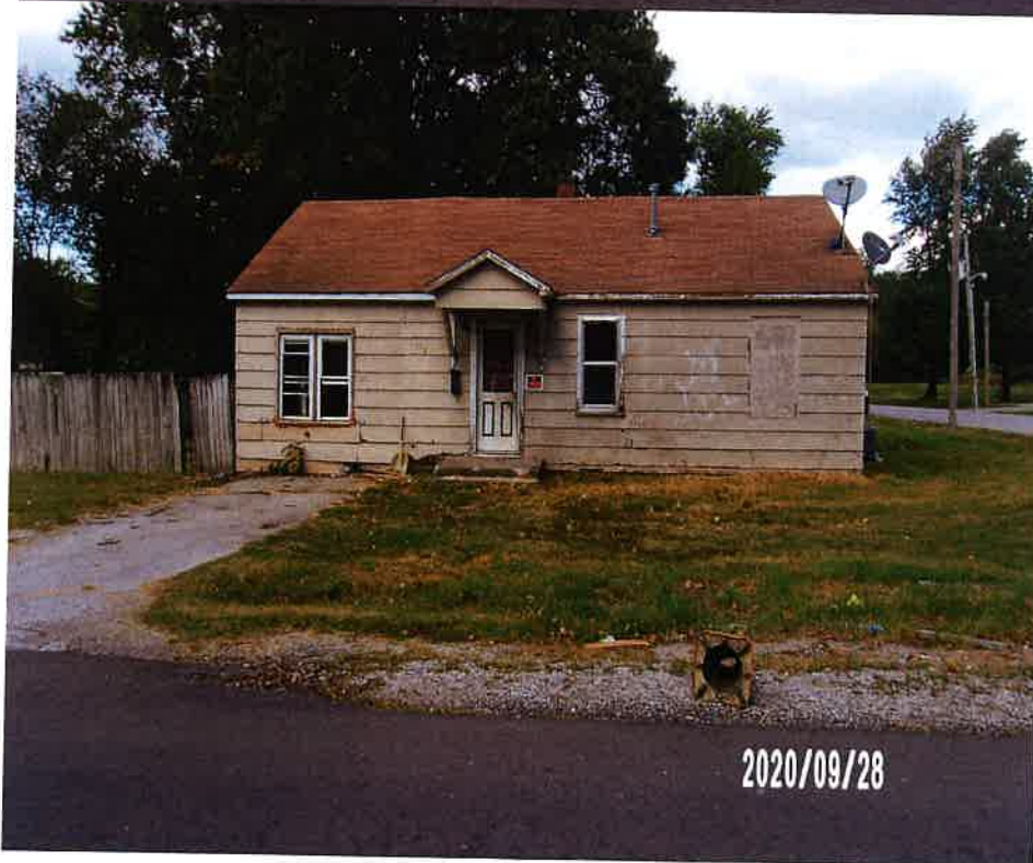
106 E 17th St—After